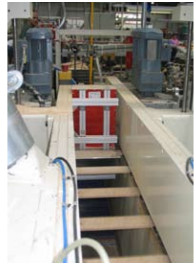
prior to the measurement

VenScan Sensorhead for contactless moisture measurement of upper layers for solid-wood parquet after the Double End Profiler