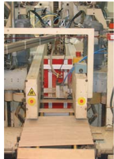
right after measurement (incl. automated colored spot marking)