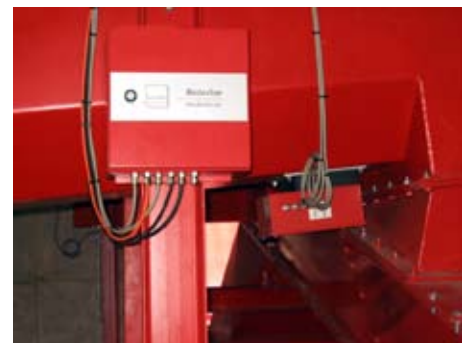
integrated in the outlet screw conveyor of the mixing vessel