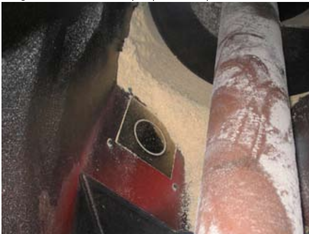
integrated in screw conveyor (inner view)